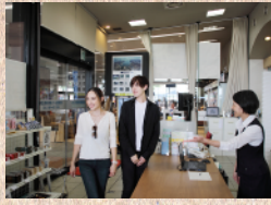
Sasebo Tourist Information Center (JR Sasebo Station)