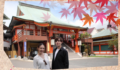
Kurokami-zan Buddhist Temple