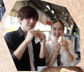
Yonkacho Shopping Street