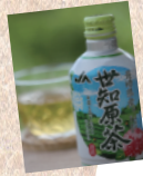
Japanese Sweet & Sechibaru Green Tea