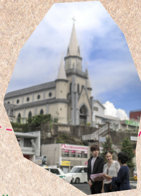
Miura-cho Catholic Church