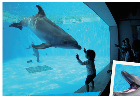
Kujukushima Dolphin pool

An aquarium where you can enjoy yourself as if you are swimming around the Kujukushima.