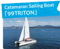
Catamaran Sailing Boat [99TRITON]

Hop onboard the elegant Pearl Queen and experience excitement when she travels through narrow pathways between islands and makes a sharp U turn in one of the coves.