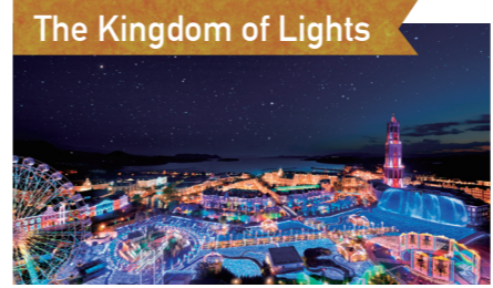
The Kingdom of Lights

Huis Ten Bosch, a moving resort of light and flowers